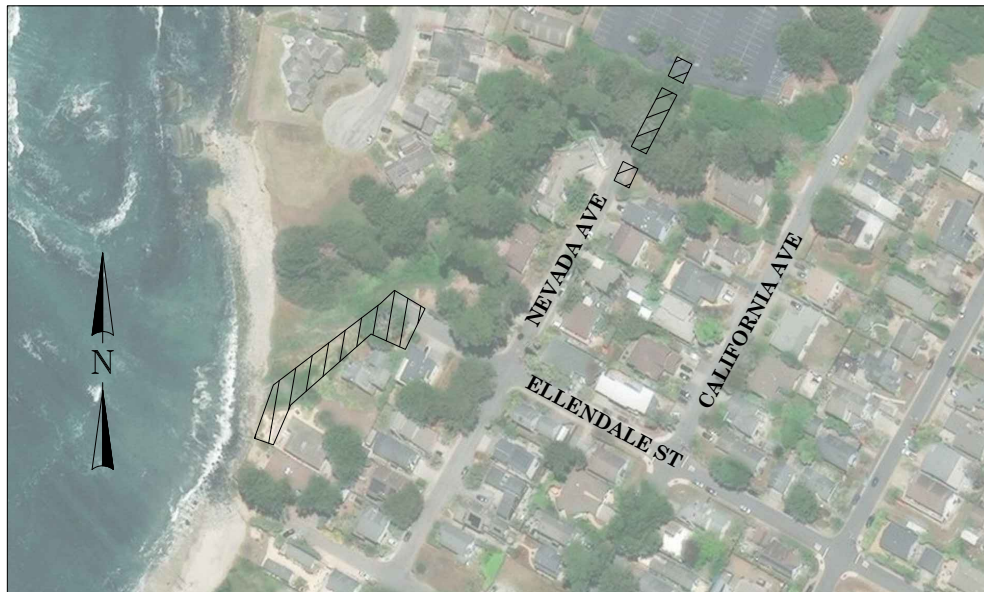
NEVADA WORK AREA